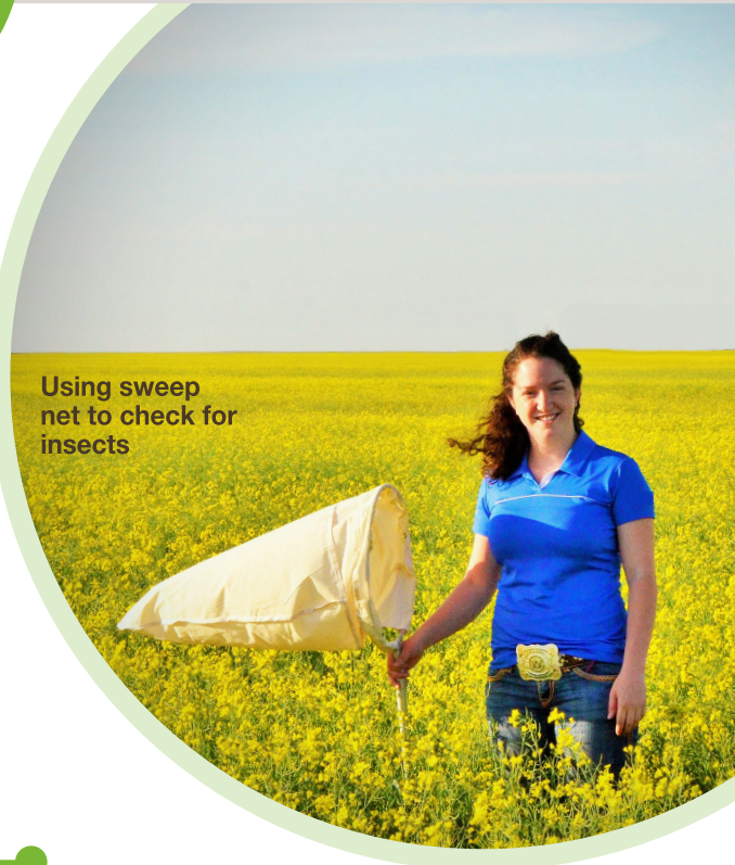
Using sweep net to check for insects

Synthetic pesticides are generally synthesized from basic elements using chemical reactions. While some synthetic pesticides are also found in nature, most are not. An example of pesticide found in nature that can be produced synthetically is glufosinate (a herbicide originally derived from microbes). Pyrethrin (mentioned above) is another example.