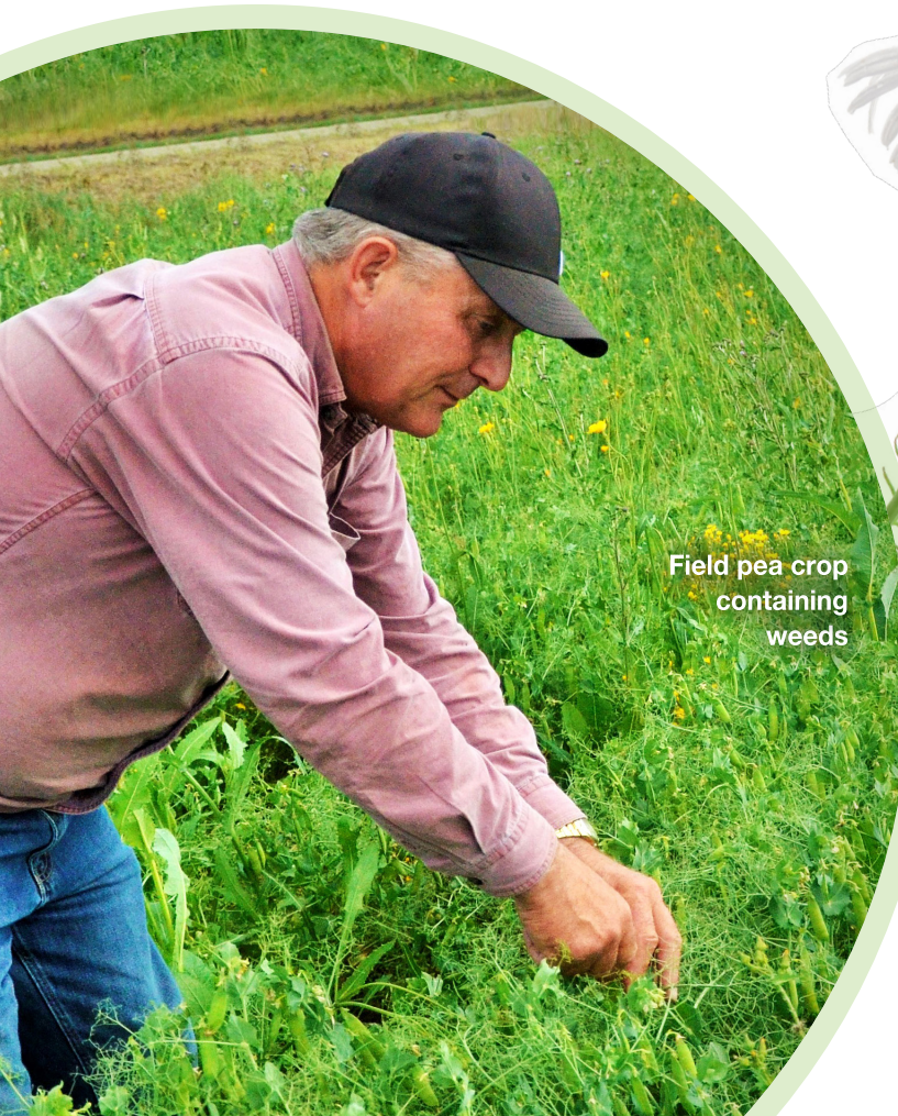
Field pea crop containing weeds

BOTH conventional and organic farming methods focus on being able to grow food into the future and ensuring the health of the land for generations to come. Both methods also focus on the production of safe and healthy food.