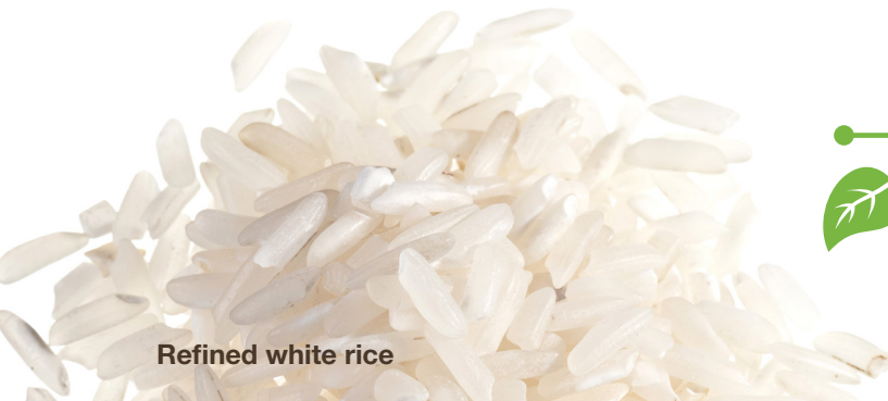
Refined white rice